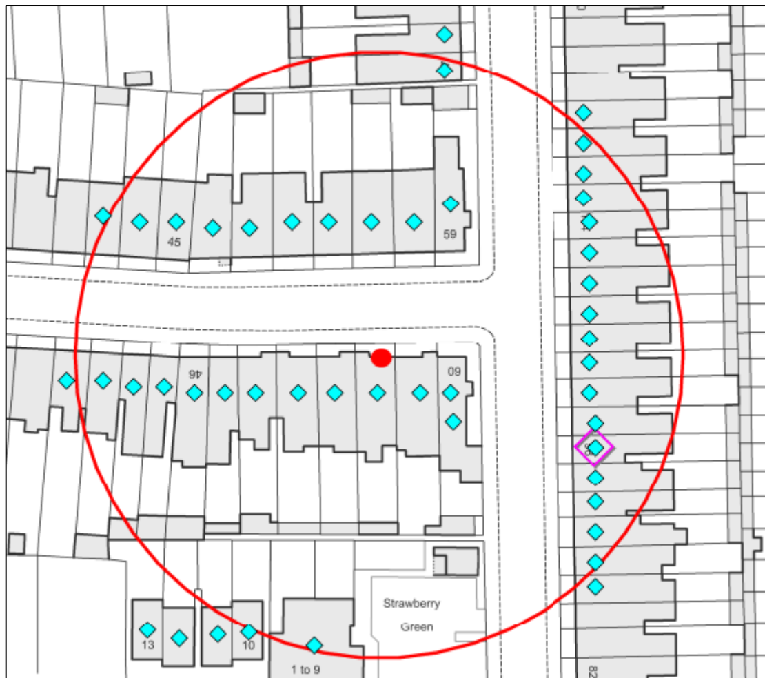
Figure 2: 50m radius of HMOs